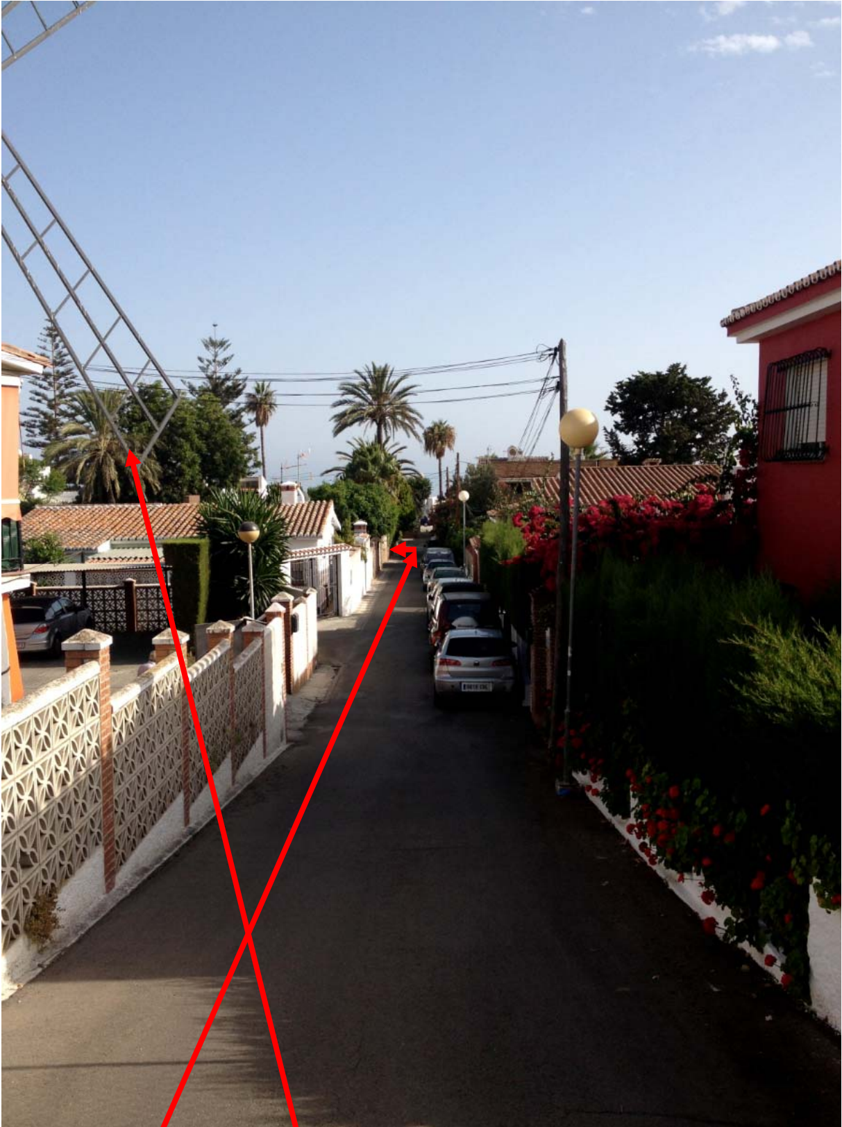
Street of the House: On the left the mill -